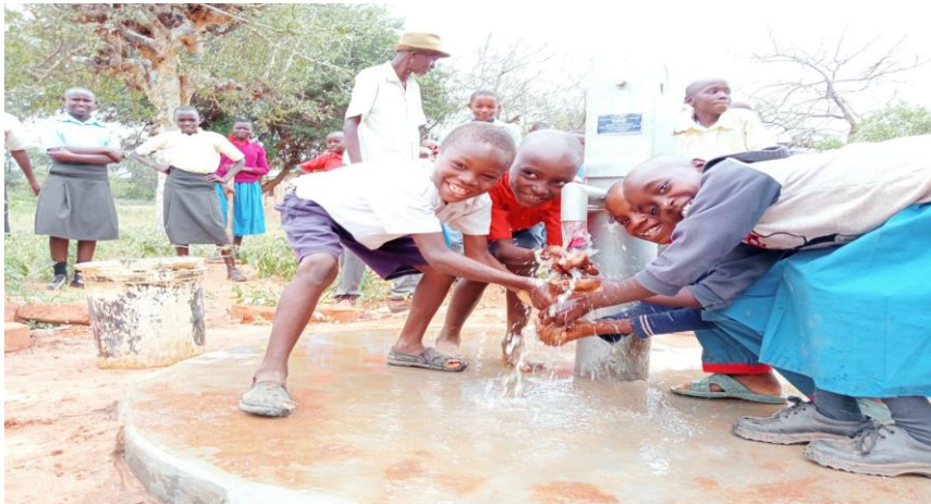
Drilled Pump at Mbia Primary School- Kitui County