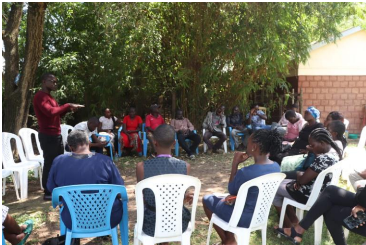
A stakeholder meeting aimed at eradicating teen pregnancies at Rabuor Chief's Camp