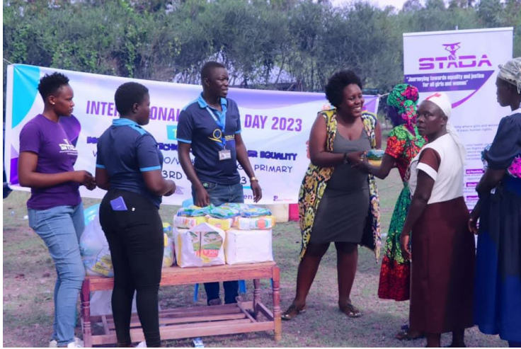
Commemoration of the International Widow's Day at Katolo Village- Nyakach Sub-County