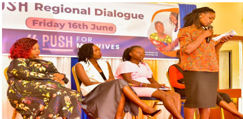
STADA Participation at the PUSH Regional Dialogue meeting