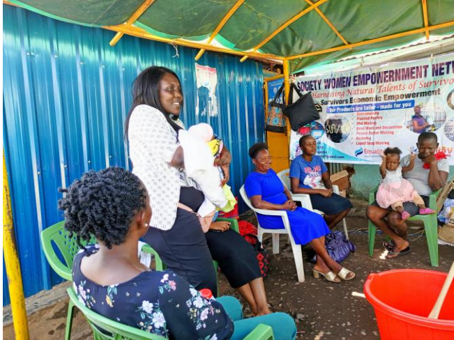
A visit (exchange program) at the Society Women Empowerment Network (SWEN) in Manyatta-Kisumu County