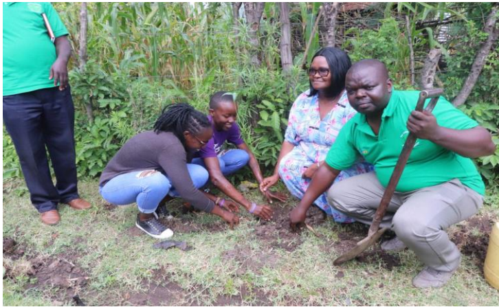
Tree Planting Ceremony at the Angelic Christian Community School