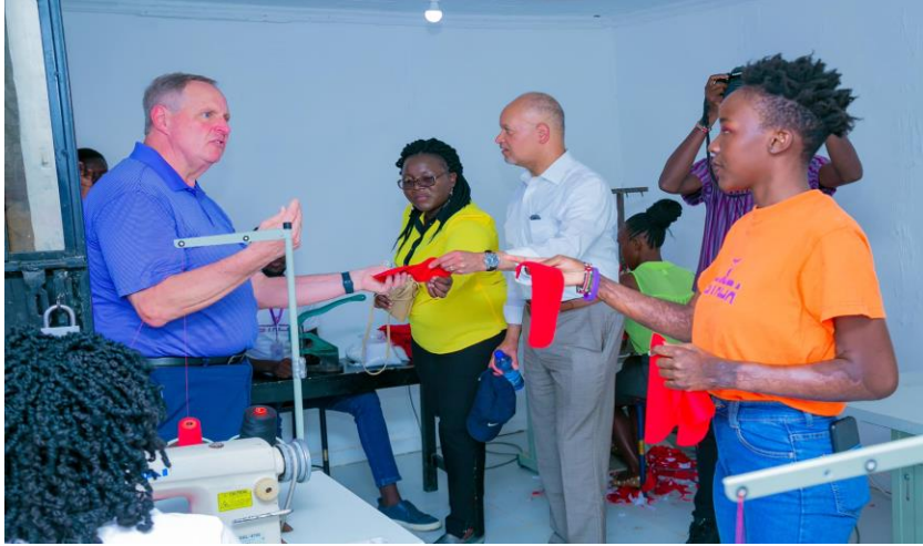
Sanitary towels production demonstration during the USAID/ RKP Visit at STADA Office