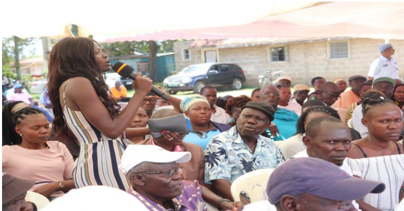
STADA Public Participation- Kadibo Chapter