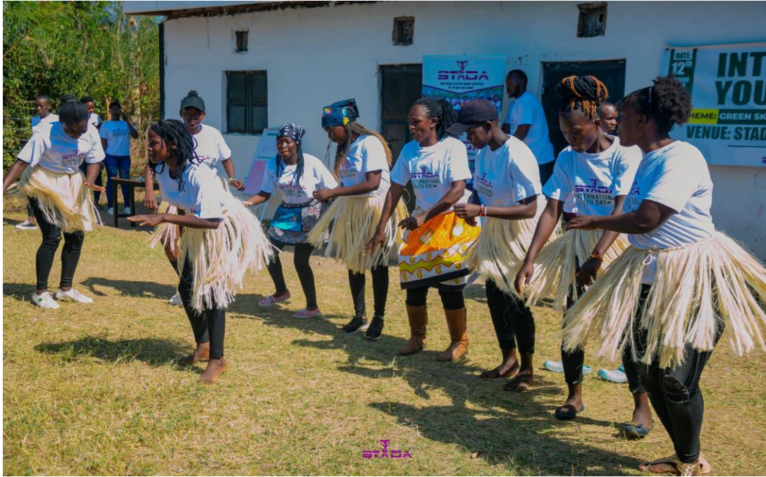
International Youth Day Celebrations at STADA Office