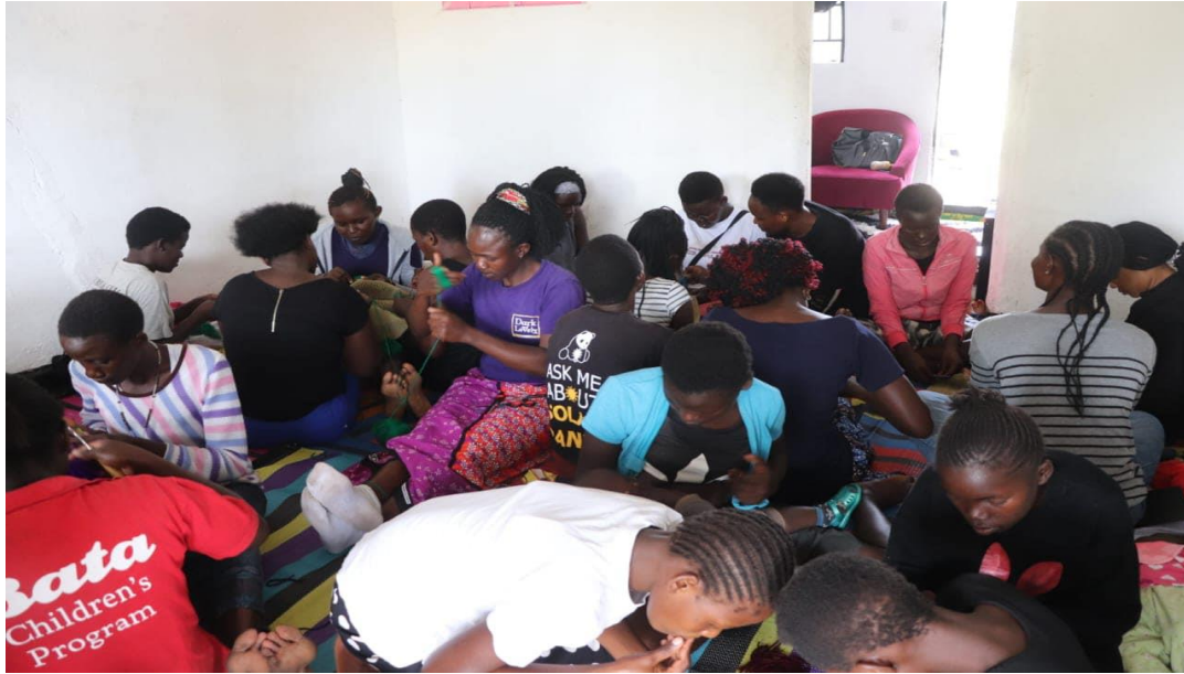
Teen Mums crocheting session at the Teen mums center.