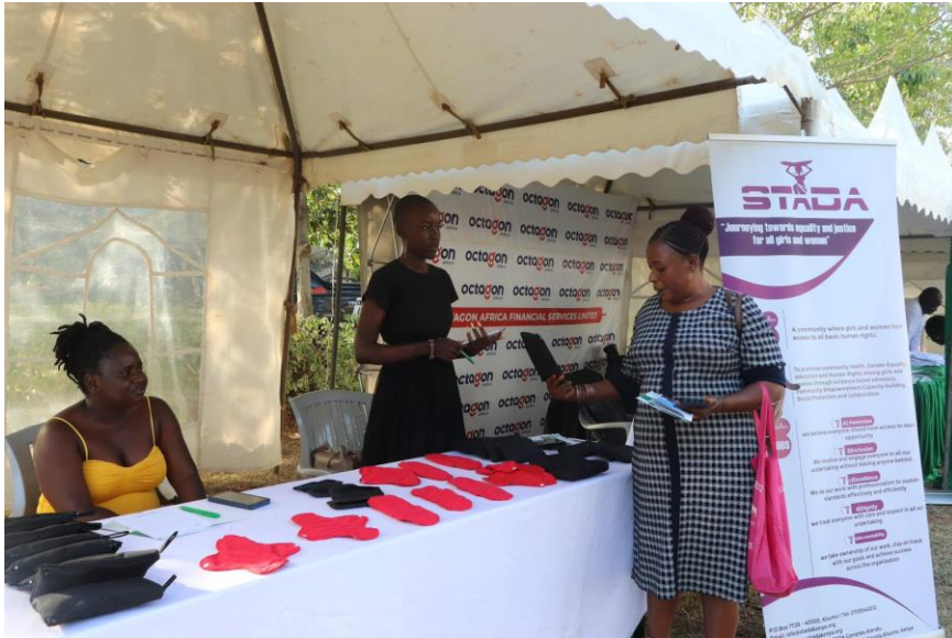
Showcasing the STADA Re-usable sanitary Towels during the TICH Conference