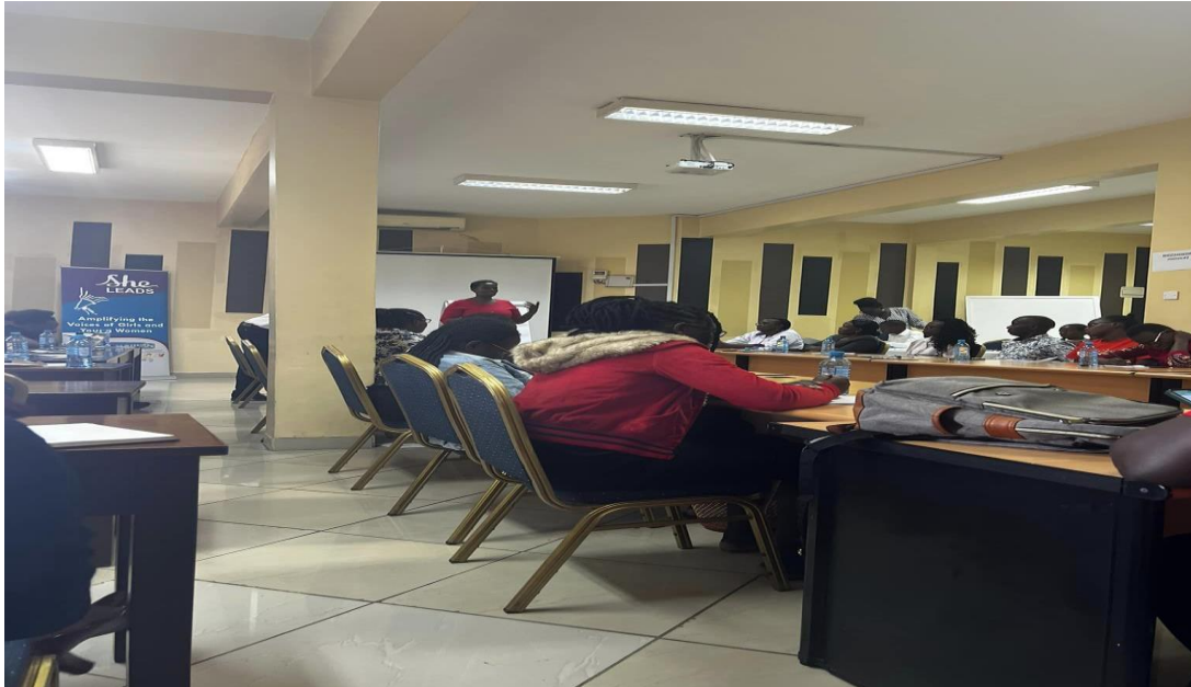
Participation at the Kisumu County's gender sector working group meeting