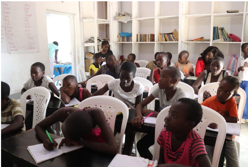
Engagement of students at the STADA community library