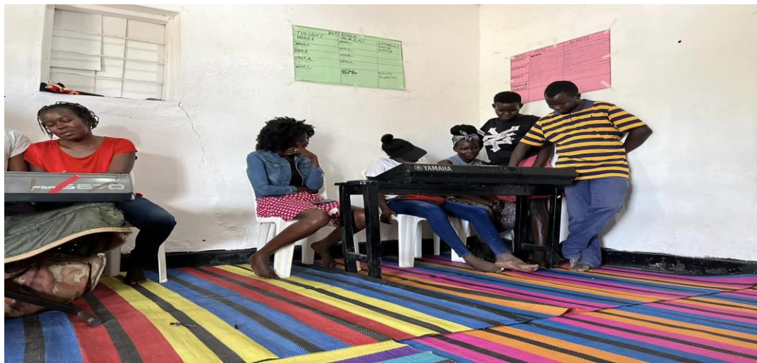
Piano classes at the Teen Mums centre