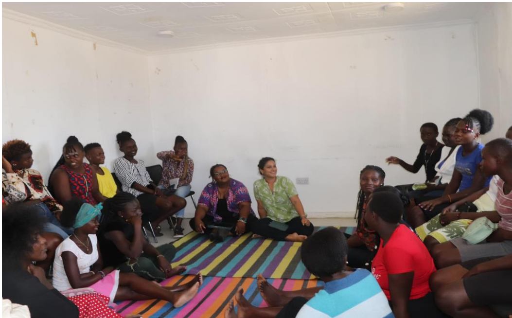
Young Mothers engagement with CRIF at STADA office