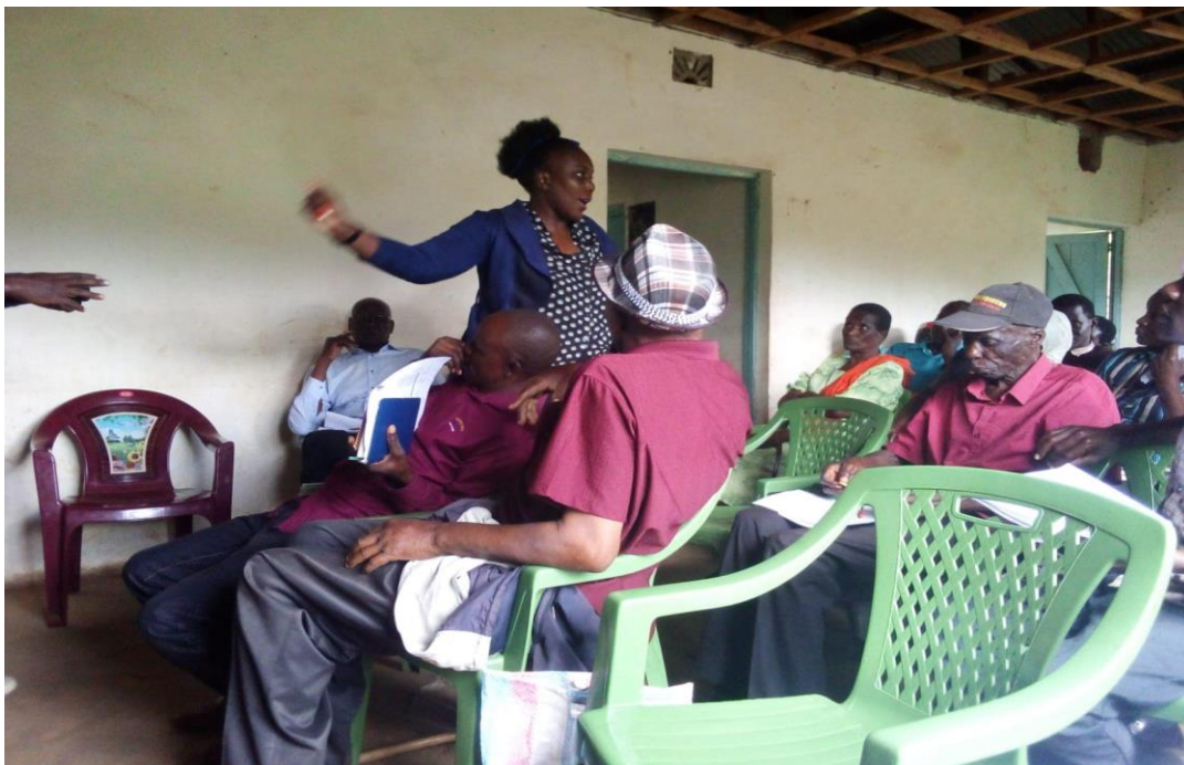
Public participation meeting at Nyando