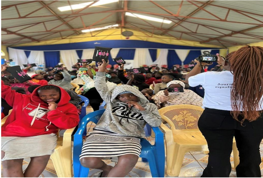
Re-usable sanitary towels distribution at Korogocho in Nairobi