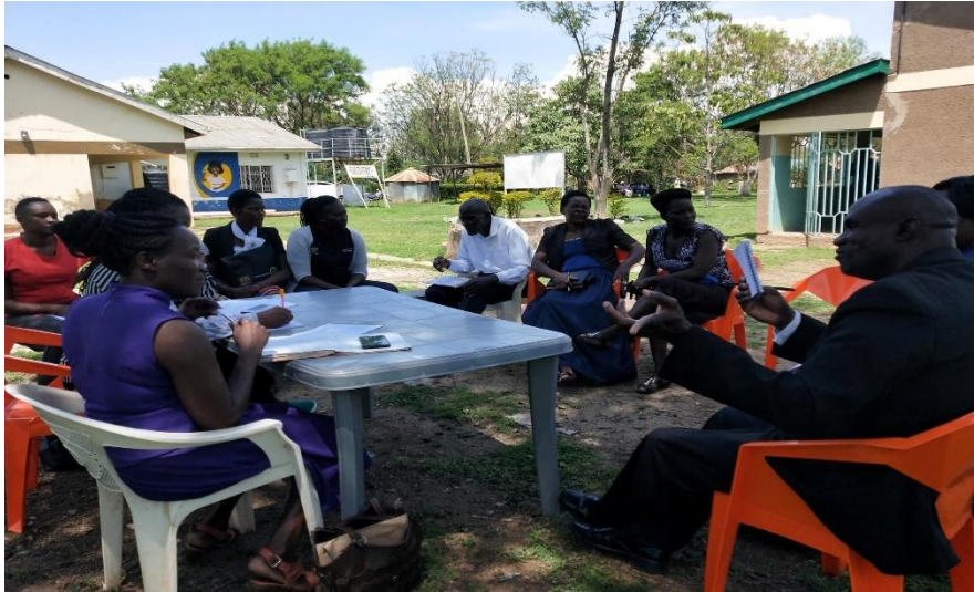
Stakeholder's engagement meeting at Nyang'ande Sub-County Hospital