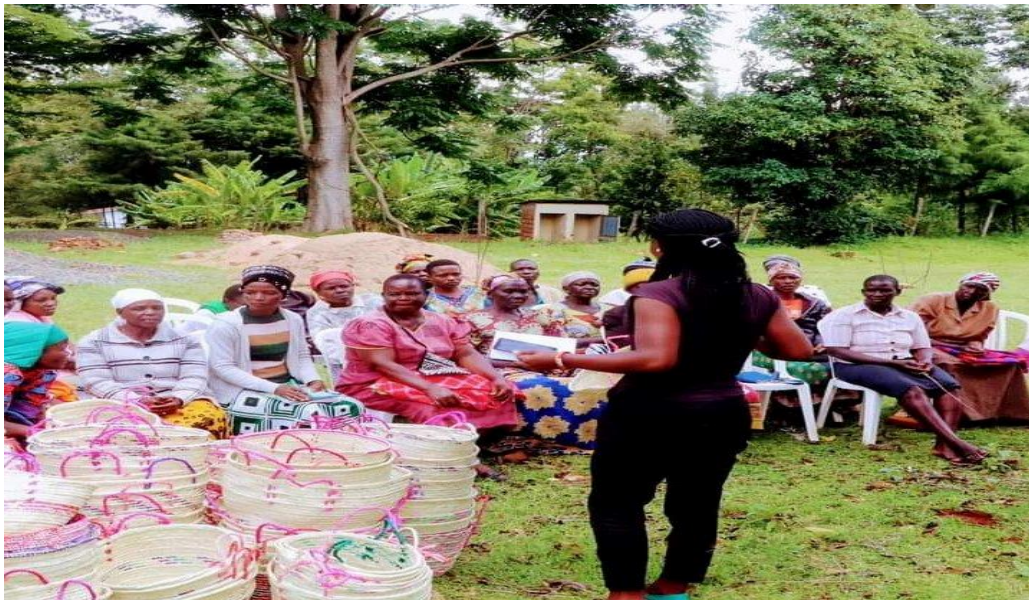
Woven baskets, made and displayed by Ng'uono Widows in Nyakach