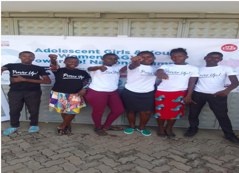
A section of STADA teen mothers and adolescent girls who attended Adolescent Girls and Young Women (AGYW) Power Up! National Summit at Mama Grace Onyango social hall.