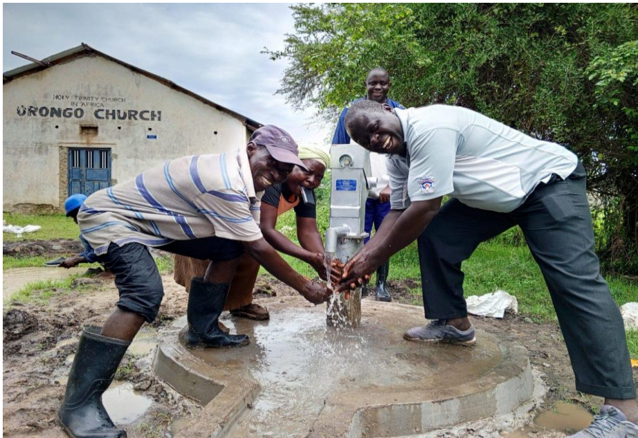
Completion of a borehole drilled at Orongo Community