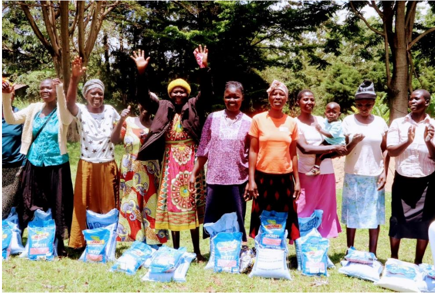
Donation of seeds and fertilizers to Wanawake Wa Stada - Nyakach Widows Group