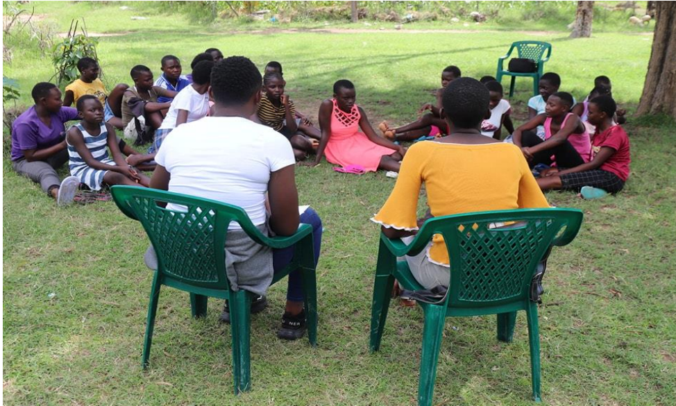
Adolescent girls' dialogue at Chiga Primary