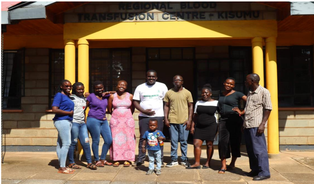
A section of the humanitarian department members who went for a blood donation at the Regional Blood Transfusion Centre- Kisumu