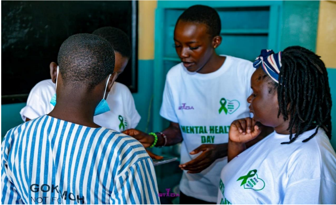
Commemoration of the World Mental Health Day at Kisumu County and Refferal Hospital Hospital