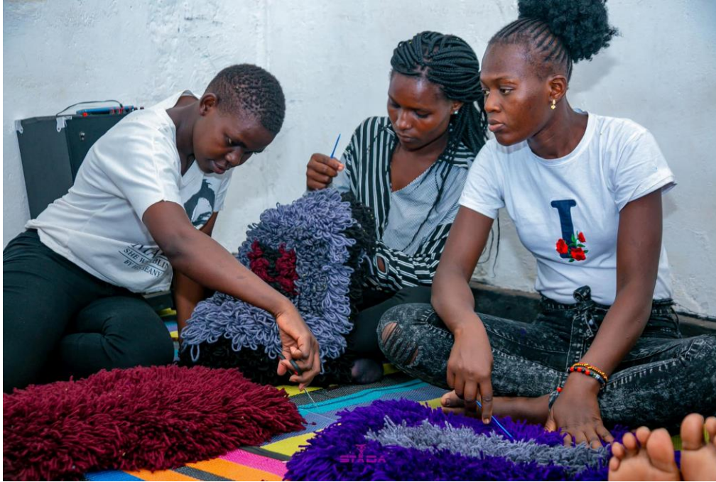
Showcasing items/mats handmade at the STADA teen mums centre