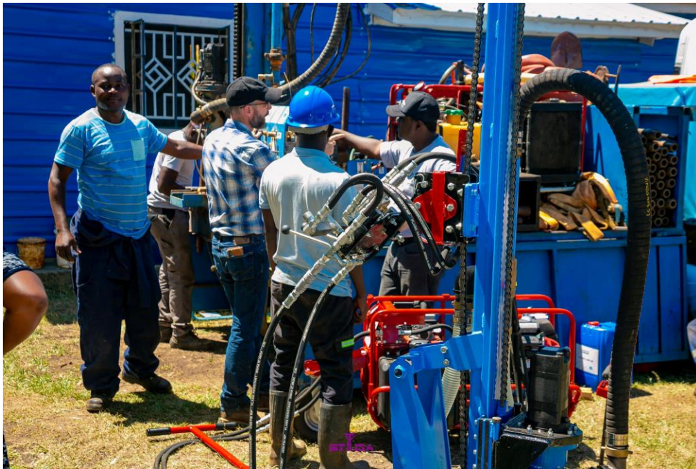
Training and setting up of a new machine during the Life Water International conference. In attendance are teams from Kenya, Liberia and Nigeria.