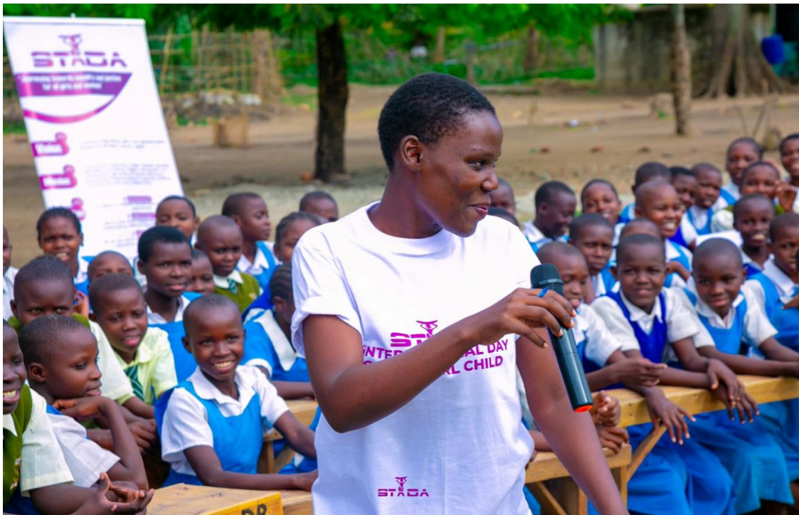
International Day of the Girl Child Celebration at Nyamware Primary.