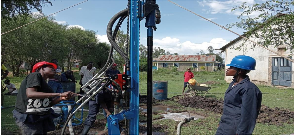
Pump drilling at Orongo Centre