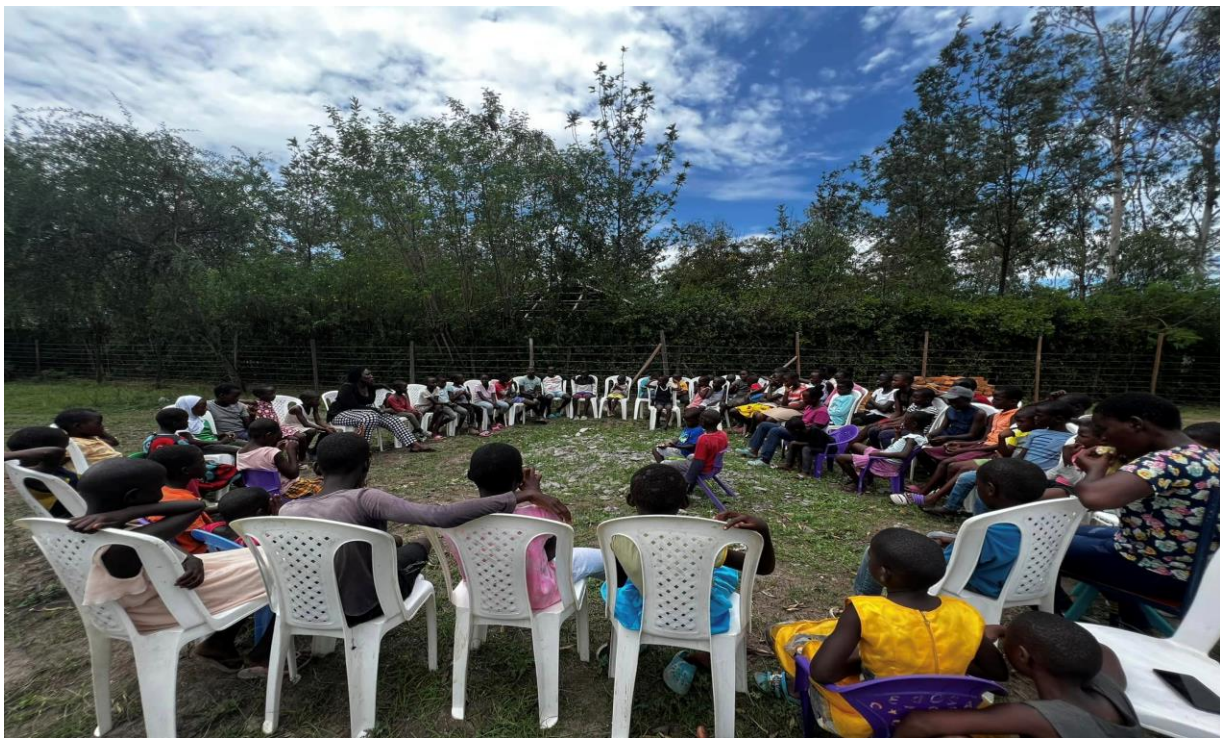
Director's meeting with students attending the STADA Community Library