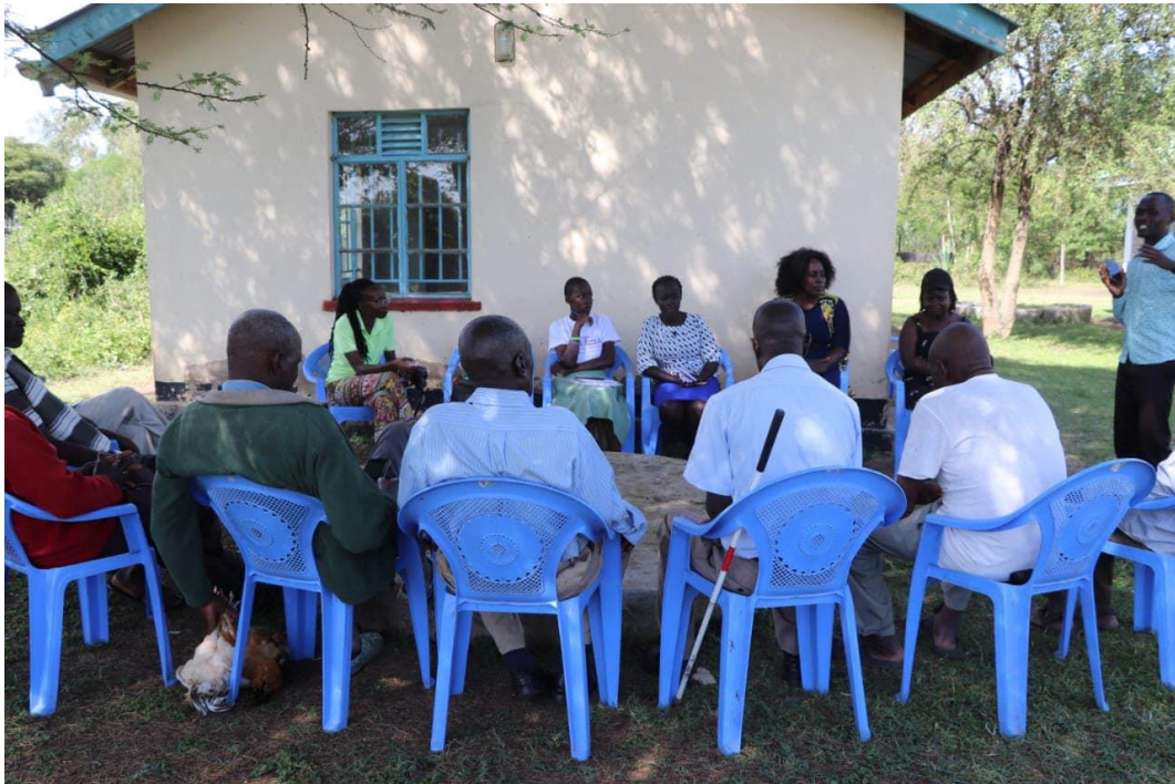
STADA Community engagement at Rweya Village