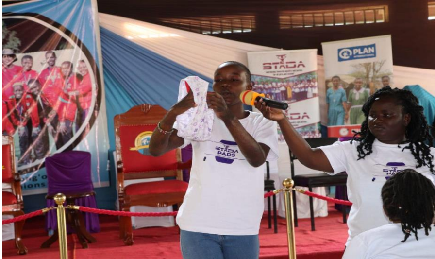
Re-usable sanitary towels use exhibition at Ratta Primary, Seme Sub-County, during the World Hockey Team awards ceremony.