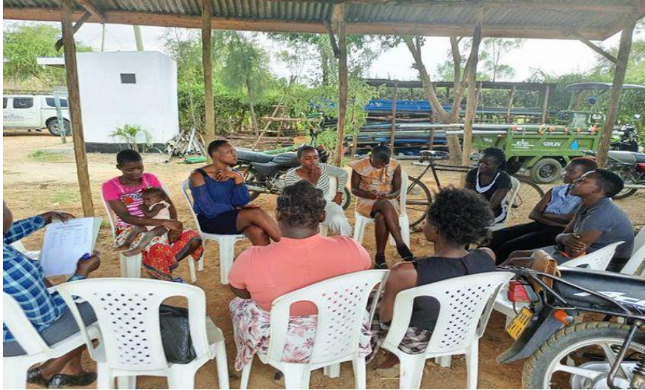
Feminist Movement Building meeting at the STADA main office