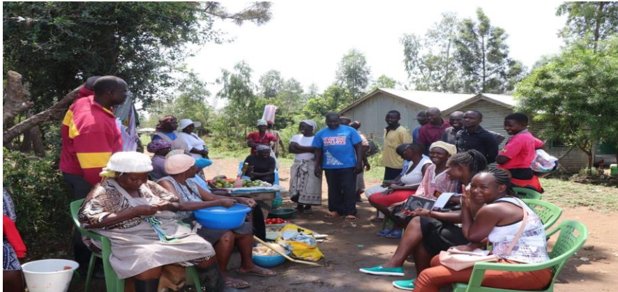
STADA Community dialogue at Oseth Beach