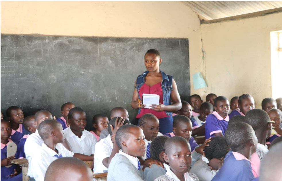
GBV, mental health and reproductive health sensitization at Odienea Primary