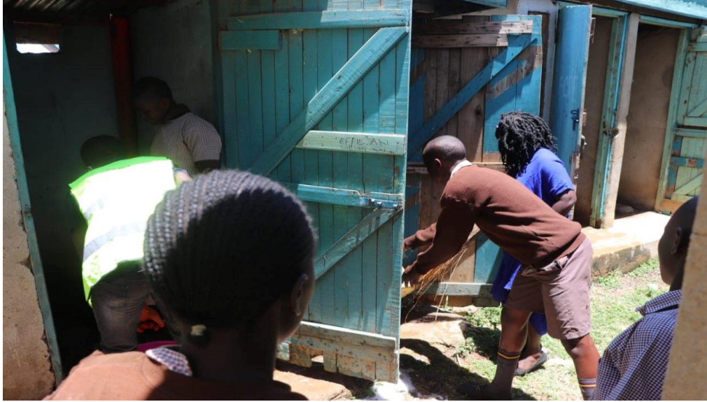
Humanitarian department clean-up exercise at Dunga Primary