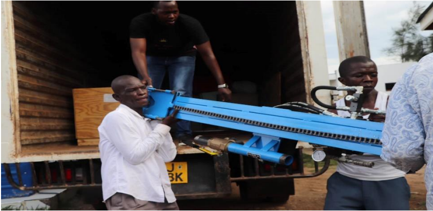
Offloading new drilling equipment at STADA office