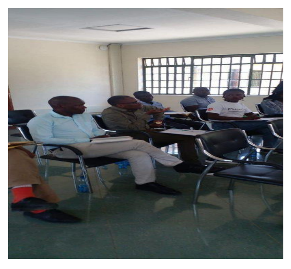
Participation in the Nyando Court Users' Committee Meeting