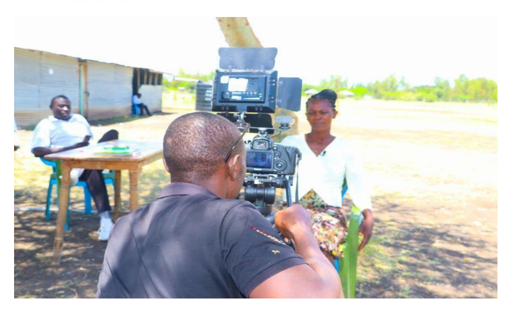
Documentation of community stories at Ogenya Primary by the Communications Department