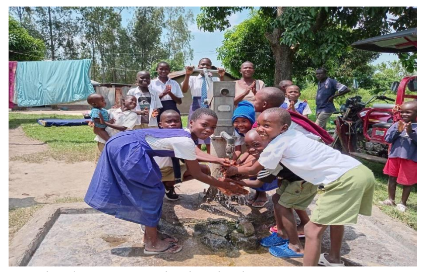
Completed pump repair by the Plumbing team