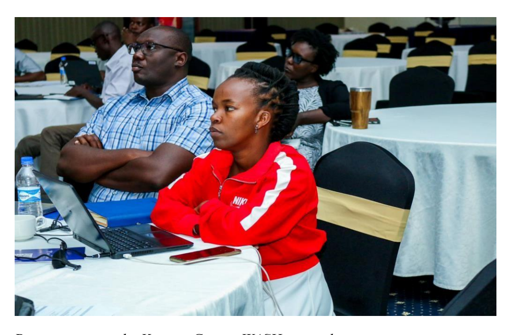
Participation at the Kisumu County WASH network meeting