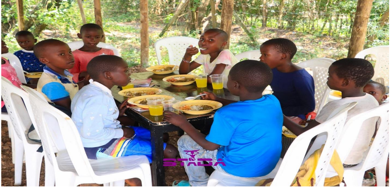
STADA Community Library feeding program