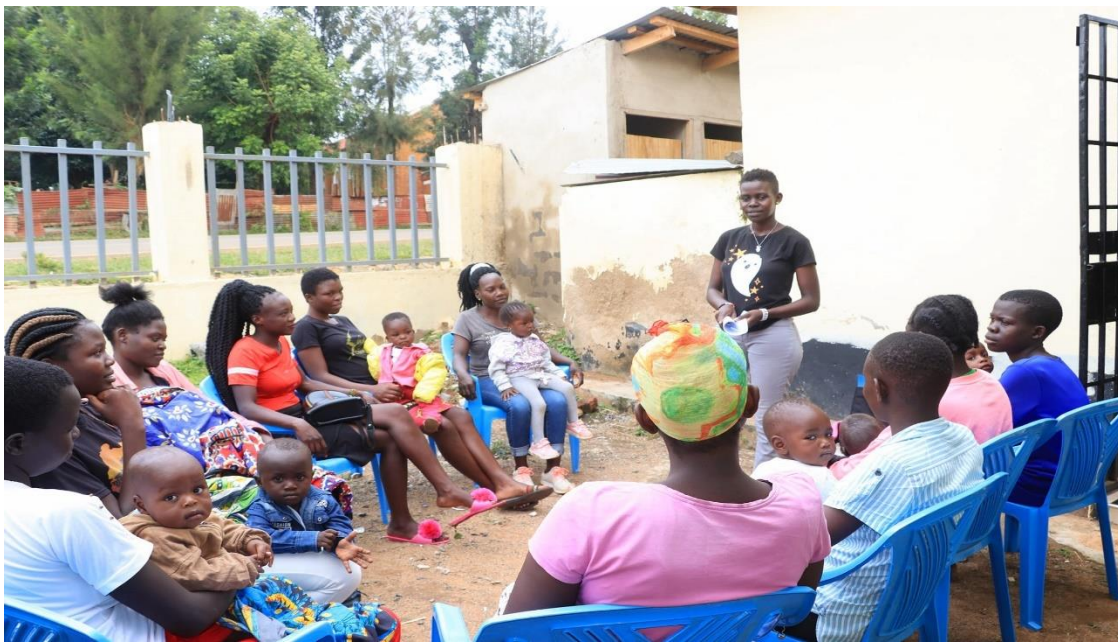
Engagement with teen mums at Nyabondo