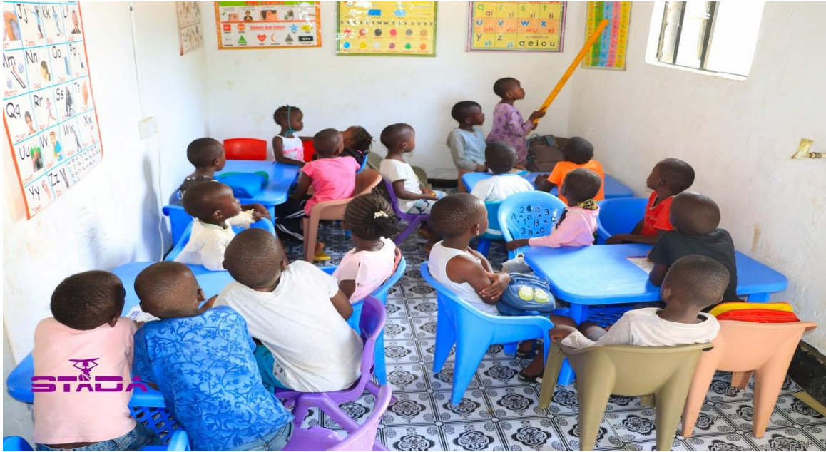
Learner's sessions at the STADA Community Library