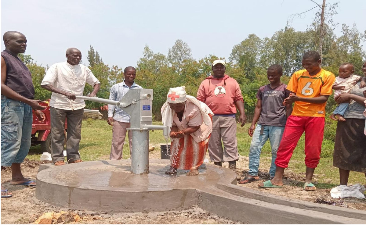
Completely drilled and installed borehole