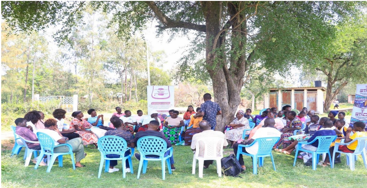
Health and hygiene talk in the community