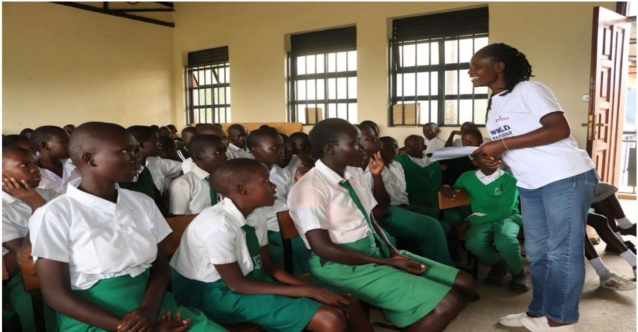
Student Mentorship sessions at Rweya Primary School