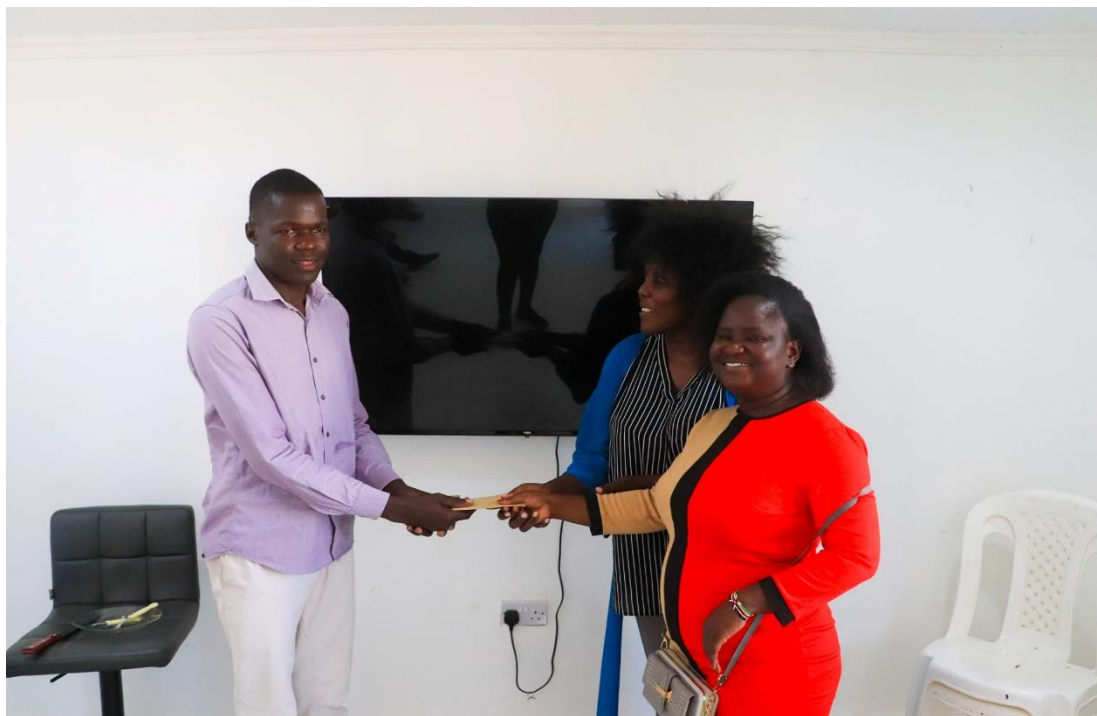
Bidding farewell to the Interns at STADA Kenya