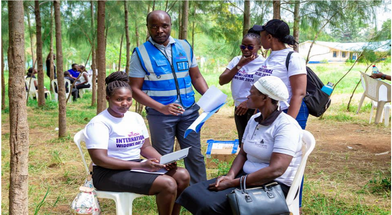
Commemoration of the International Widows Day, with Nyanam Widows