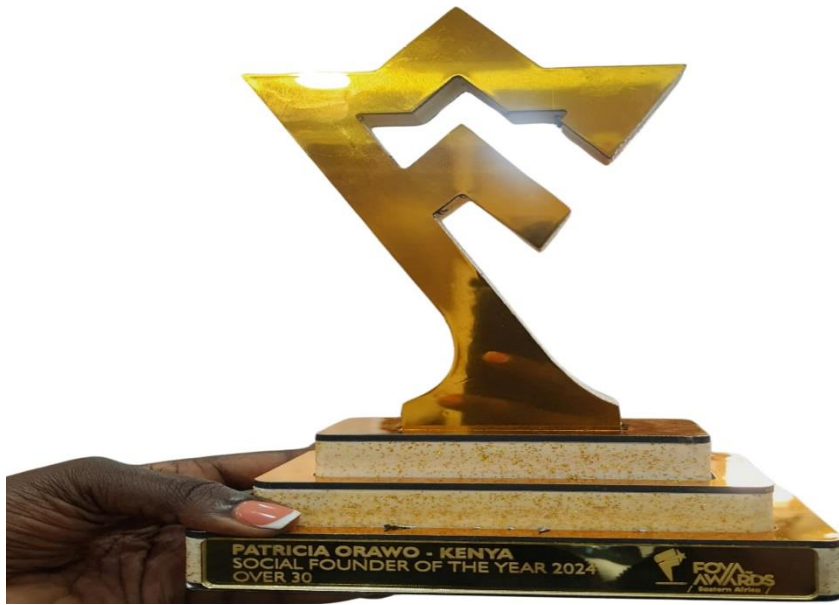
Director's award as the Social Founder of the Year, 2024