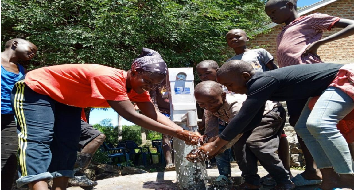
Use of the installed community boreholes