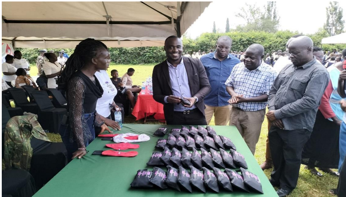
Commemoration of MHM Day at Kabete grounds in Nyakach