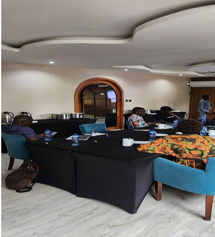
Gender Equality Grassroots Coalition monthly meeting