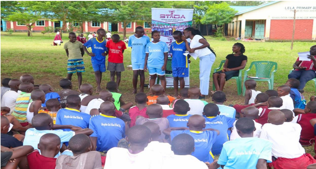
Engagement of students during the inception of the Inspire and Lead program