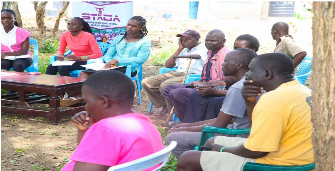
STADA Gender department community dialogue