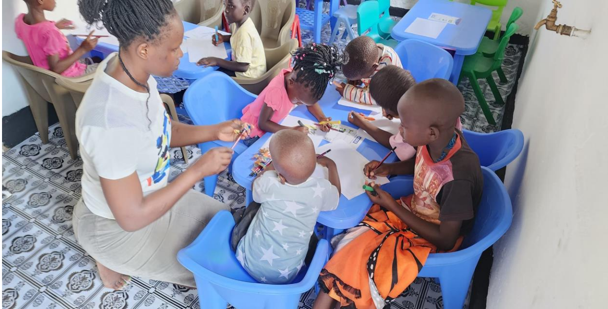
Engagement of learners at the STADA Community library upon renovation