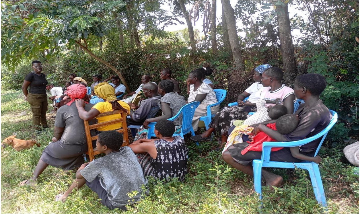
Health and hygiene talk in the community