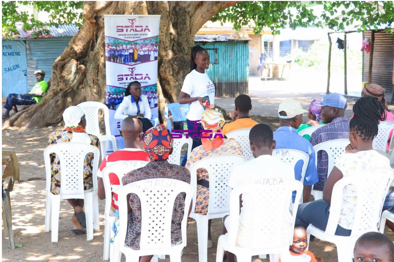
Community Dialogue at Nyamware Centre