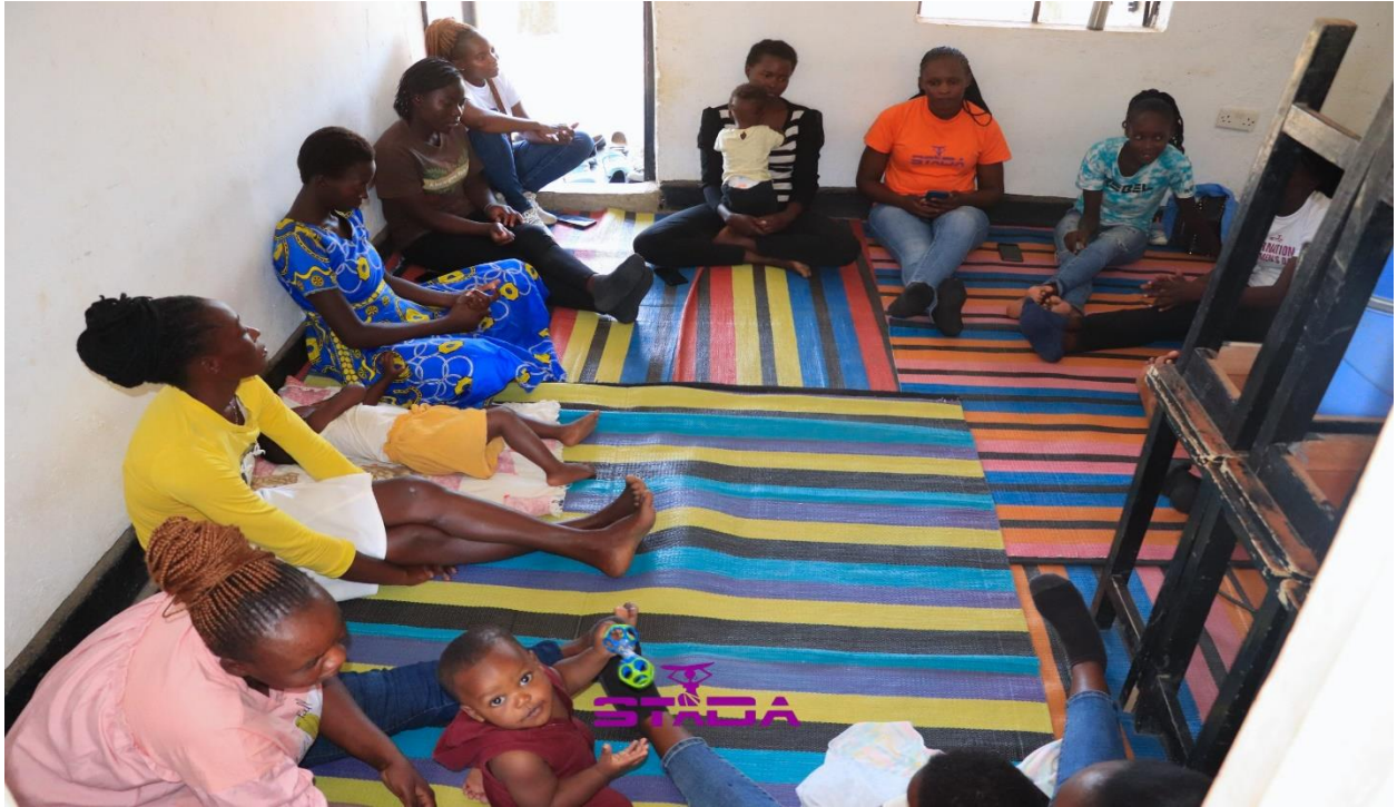
Engagement with Kobura teen mums