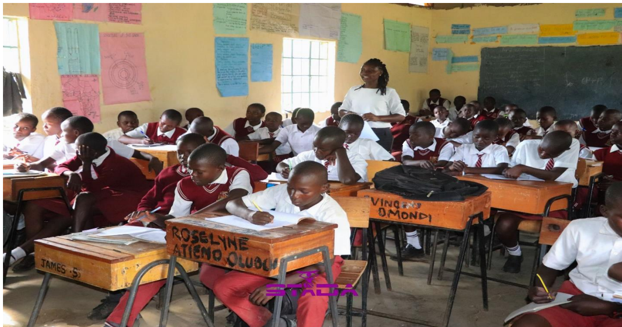
Inspire and Lead Project Activity at Lela Comprehensive School