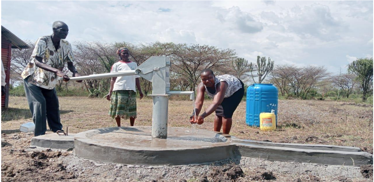
Completely drilled and installed borehole