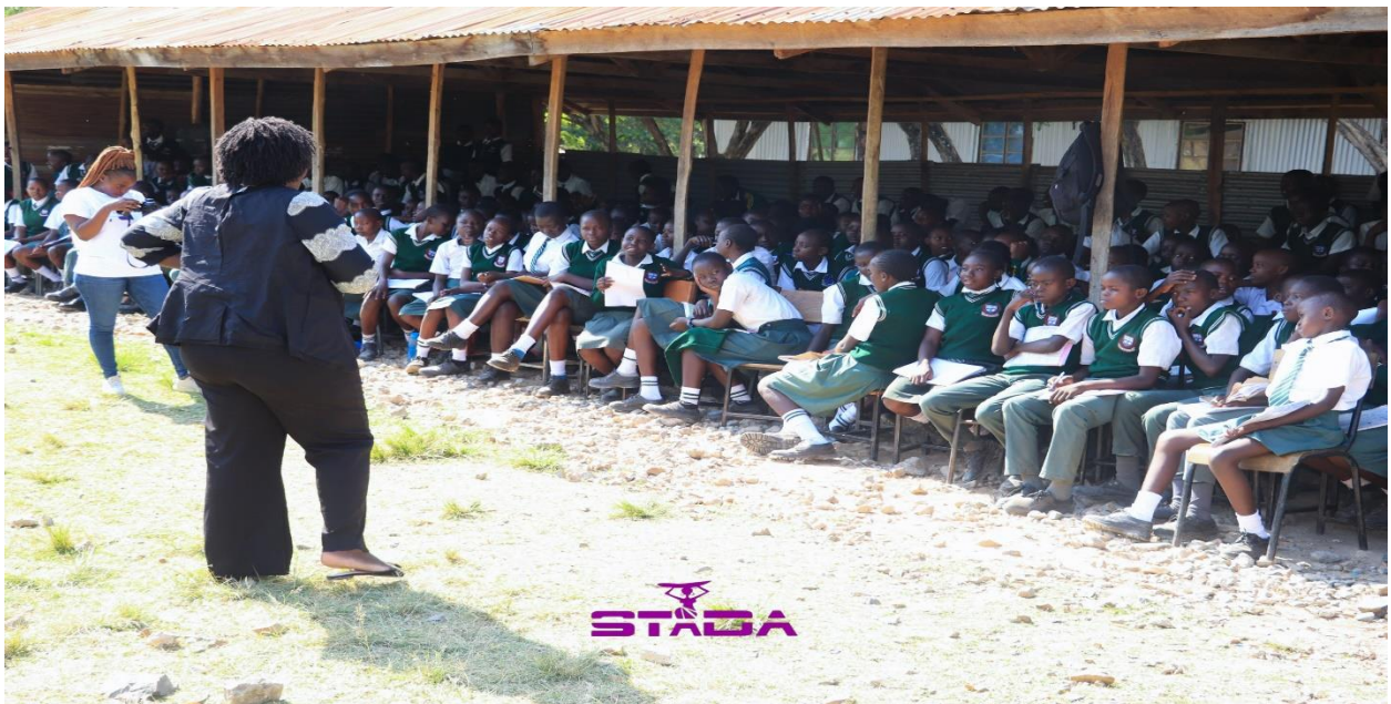
Karanda Sensitization on GBV and Mental Health