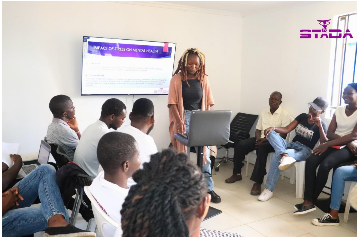
Mental Health Check-Up with STADA Staff